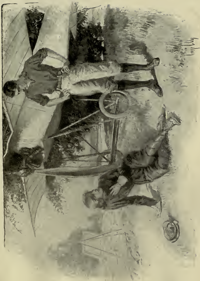
“Markham stood up and watched her, his arms a-kimbo, a tangle at his brow.”